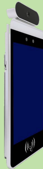
Temperature Scan & Facial Recognition Solutions