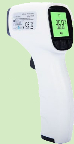
Digital Forehead Thermometer