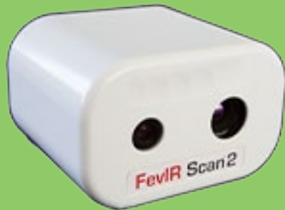
Skin Temperature Measurement System

As new protocol is developed for the changing work environment, temperature checks will be an important implementation for entering buildings. Check out our options below to get started!