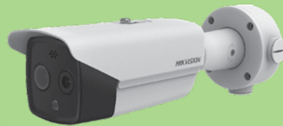
Thermographic Bullet Camera